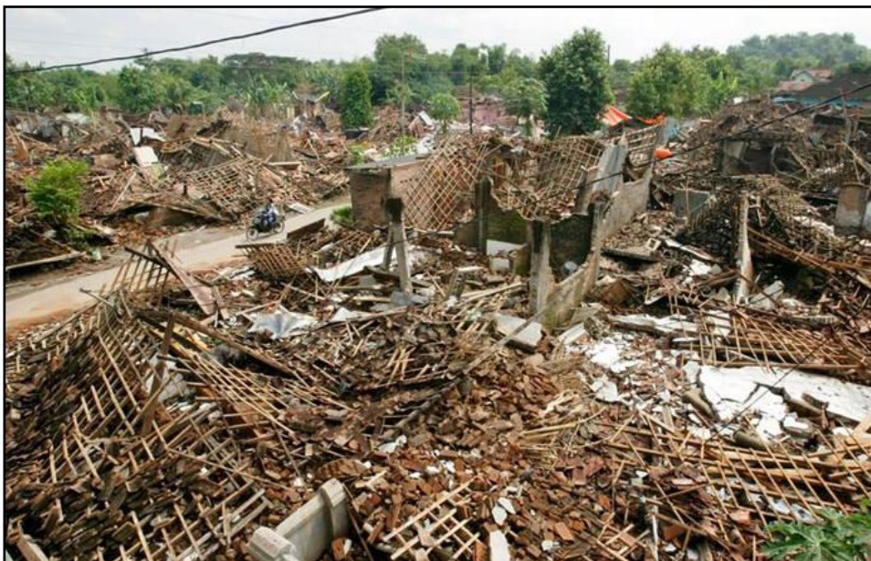
Damage from the May 27 Java, Indonesia earthquake